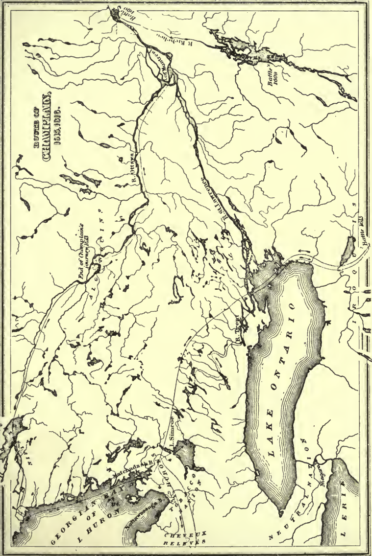
ROUTE OF CHAMPLAIN'S VISITS TO ONTARIO, 1613 AND 1615-16.