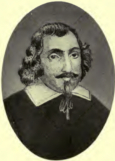
SAMUEL DE CHAMPLAIN,

Founded Quebec, 1608. Visited Algonquin Indian Village on Ottawa River, 1613, and arrived at Huron Country, in present County of Simcoe, August 1st, 1615.