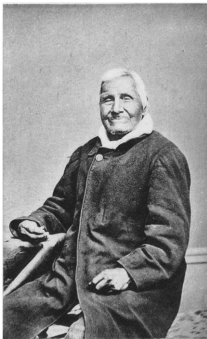
NIKONHA, THE LAST TUTELO. IN 1870; AGED 106.