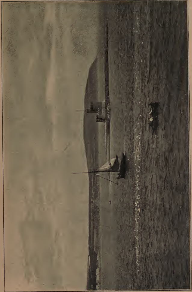
THE TOWER OF REFUGE.