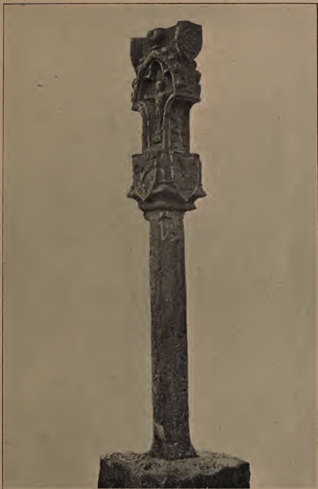
MAUGHOLD CROSS WITH "THREE-LEGS."