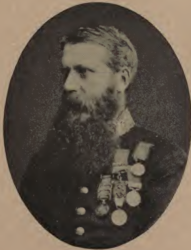
LORD LOCH. B. 1827; D. 1900.

paying the expenses of the government of the island. Forty years later the Manx people were deprived even of this hope, though the balance thus remaining then amounted to a considerable sum, and, at the same time, their harbours and public