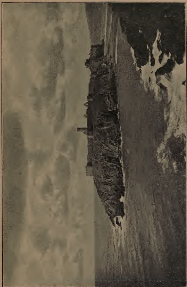
S. PATRICK'S ISLAND.