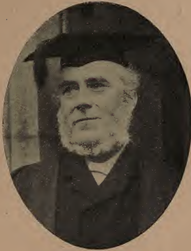
THE REV. T. E. BROWN. B. 1830; D. 1897.