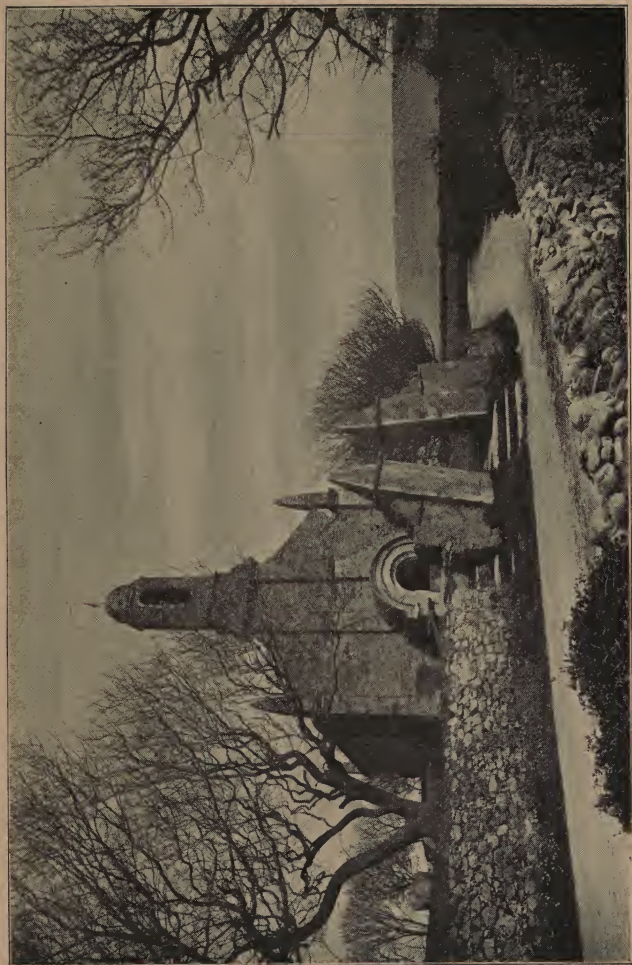
BALLAUGH OLD CHURCH.