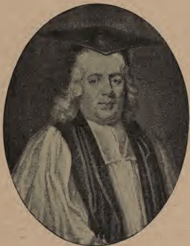
BISHOP THOMAS WILSON. B. 1663; D. 1755.