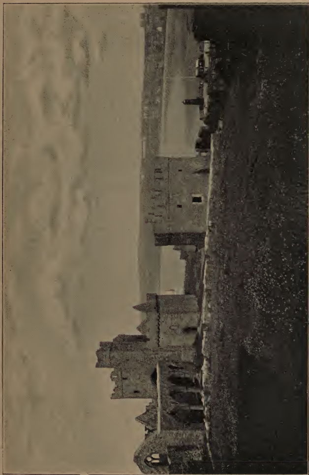
S. GERMAN'S CATHEDRAL AND PEEL CASTLE.