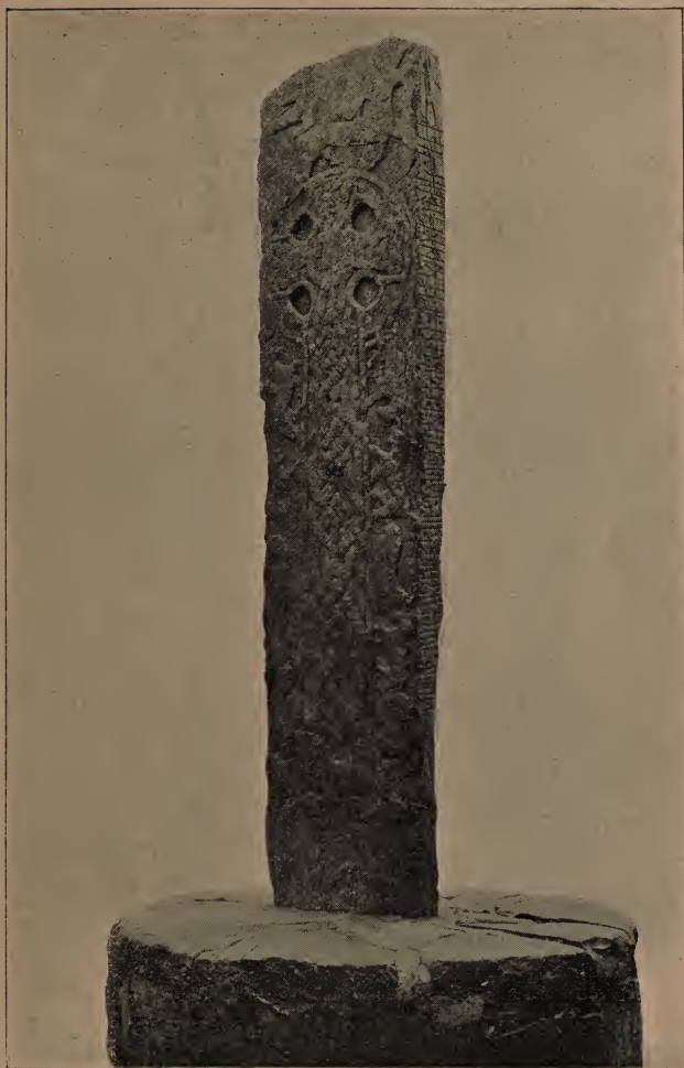
CROSS AT KIRK MICHAEL.